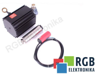
XUYAFV946S SCHNEIDER ELECTRIC